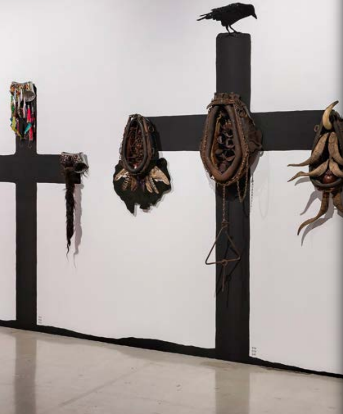
Image: Karla Dickens, 'Warrior Woman VI & XIII', 2017; 'Workhorse III, IV & V', 2018. Installation view of Embracing Shadows , Campbelltown Arts Centre, 2023.