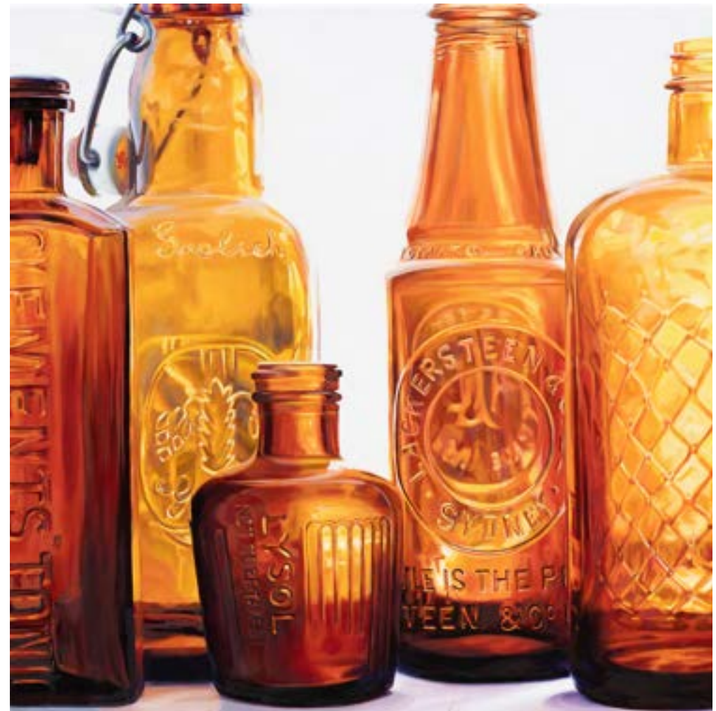
Image: 2022 Gosford Art Prize finalist exhibition, Gosford Regional Gallery.

Entries open on 24 May 2024 and close on 8 July 2024 at 4pm